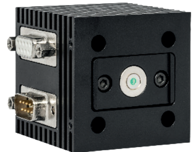
nanoplus heatsink for TO5 or TO66 housing