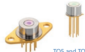
TO5 and TO66 header