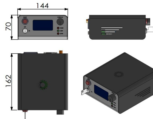
162(L) × 144(W) × 70 (H) mm 3 , 1.0kg