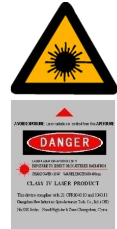
FC-W-447C (Air cooled)