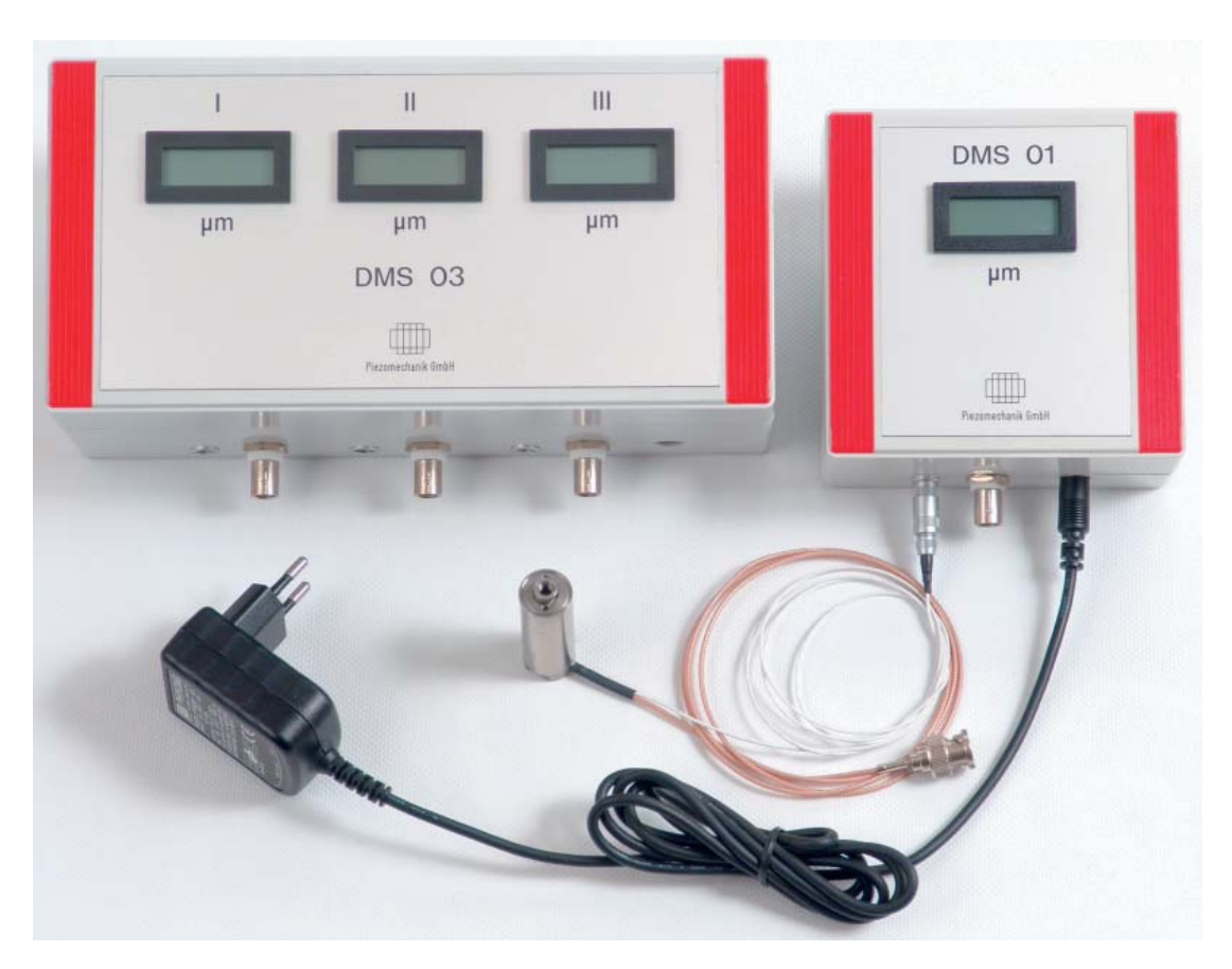
Fig. 3 Strain gage amplifiers DMS01 and DMS 03

Triple channel amplifier, dimensions W x D x H (mm) 240 x 120 x 60, weight 550 g (power supply included)