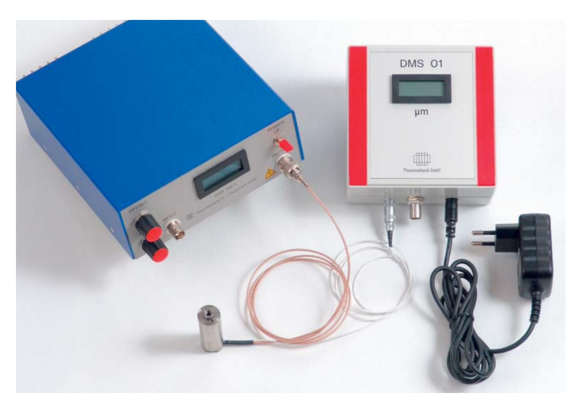
Fig. 1 Strain gage amplifier DMS 01 connected to a piezo actuator with option position sensing and SVR piezo amplifier

Check also PIEZOMECHANIK's actuator catalogues for option "position detection"