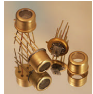
Main thermocooler parameters (without load)